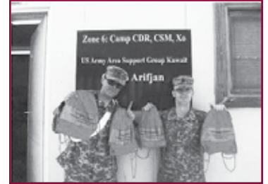
Members of the 37th Infantry Brigade Combat Team – Ohio Unit